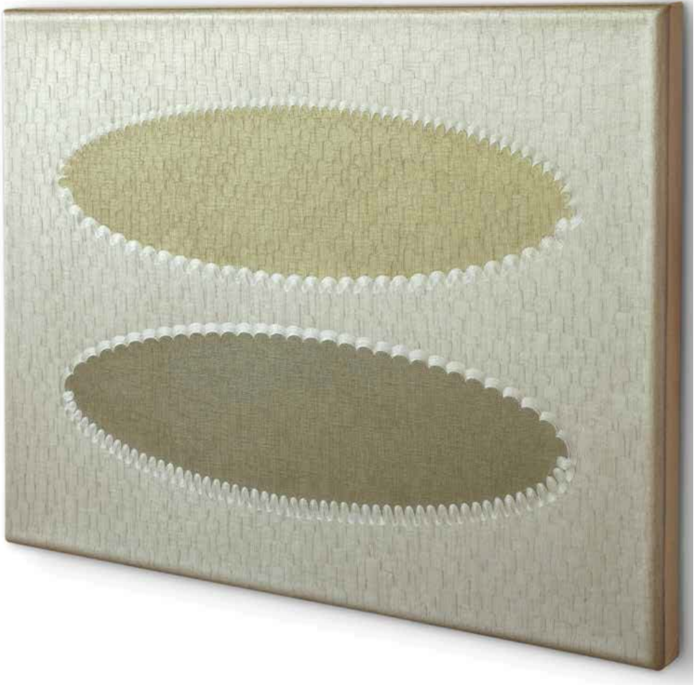
Shadow Play(side) 2009 Oil on canvas 64 x 84 cm