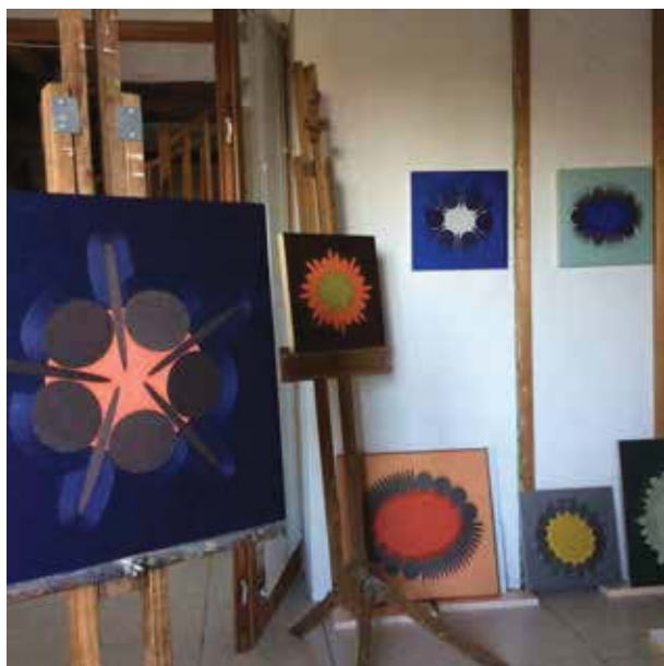
Jane Harris's Studio at Twilight 2017

Paul Cézanne Mont Sainte-Victoire and the Viaduct of the Arc River Valley 1882–1885 Oil on canvas 65 x 82 cm The Metropolitan Museum of Art